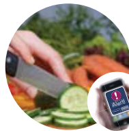
Alerts can be delivered by alarm beacon, email or text message.