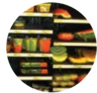
From storage to storefront, the ColdStream Site Network monitors your facility for visibility and compliance.