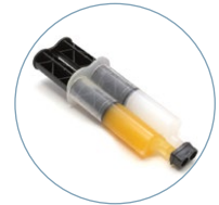
The ColdStream Site Network monitors your facility for visibility and compliance.