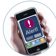
Alerts can be delivered by alarm beacon, email or text message.