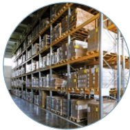
The TempTale Site wireless sensors communicate with the ColdStream Site Network Controller.