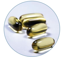
The ColdStream Site Network monitors your facility for visibility and compliance.