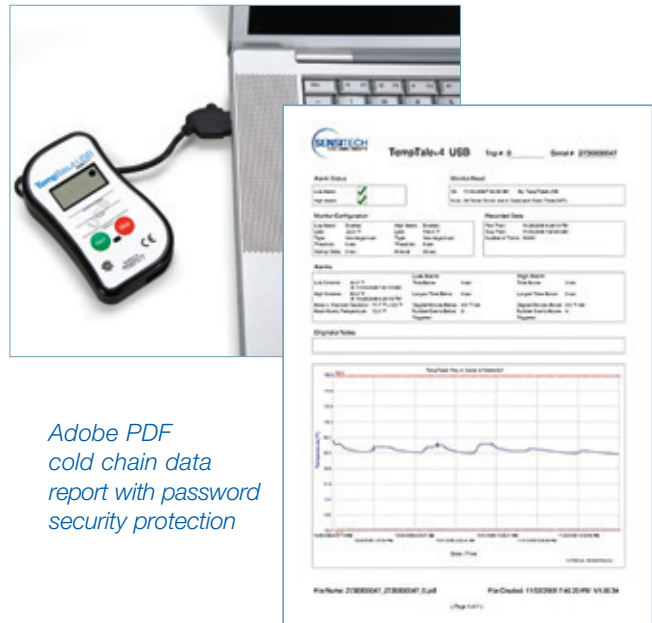
Adobe PDF cold chain data report with password security protection