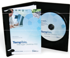
TempTale Manager® Desktop Software